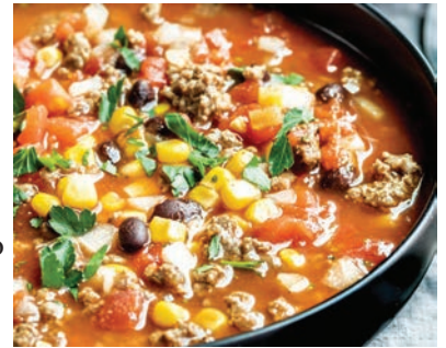
Home Made Interest

Saute onions for two minutes. Add ground beef and brown the meat. Drain browned ground beef to remove excess fat. Add ground beef mixture and all other ingredients to slow cooker. Cook on high for 4 hours or low for 6 hours. Garnish with sour cream and cheddar cheese.