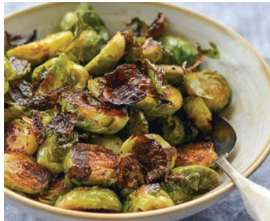
Once Upon a Chef

In a large skillet over medium heat, heat oil. Add Brussels sprouts, cut side down, and cook undisturbed 3-4 minutes, until golden on the bottom. Add 1/4 cup water and cover. Let Brussels sprouts steam until tender, 3 minutes. If the skillet seems dry, add more water a tablespoon at a time. Remove sprouts from skillet and set aside on a plate. To skillet, add vinegar, honey, mustard and garlic and whisk to combine. Bring to a simmer and cook until thick and syrupy, 6-8 minutes. Return sprouts to pan, toss to coat, and heat through, 2-3 more minutes. Season with salt and pepper and serve immediately.