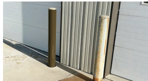
A finished post stands next to an unfinished post. At right, the student volunteers stand next to completely painted posts. In all, they painted 37 posts.

Even better, the students provided a great demonstration of one of our cooperative principles: Concern for Community!