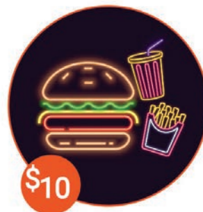
Fast-Food Combo Lunch