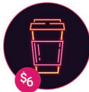
Morning To-Go Latte

Electricity fuels our daily life essentials, from heating/cooling equipment to entertainment devices and appliances. Think of how vital power is compared to other everyday purchases. That's real value.