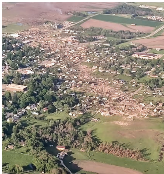
An aerial view of Greenfield that clearly shows the tornado's path through the town.