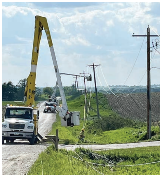
Neighboring co-op Clarke Electric Cooperative of Osceola sent mutual aid to assist with power restoration.