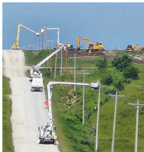
Workers from Clarke Electric and Farmers Electric work along a road to replace broken poles.