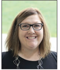
HOLI WESTON CEO

Ultimately, our electric grid is most reliable when a wide range of technologies is available. When conditions lead to lower generation from one type of source, others can help compensate, and that means you can have the power you need when you need it.